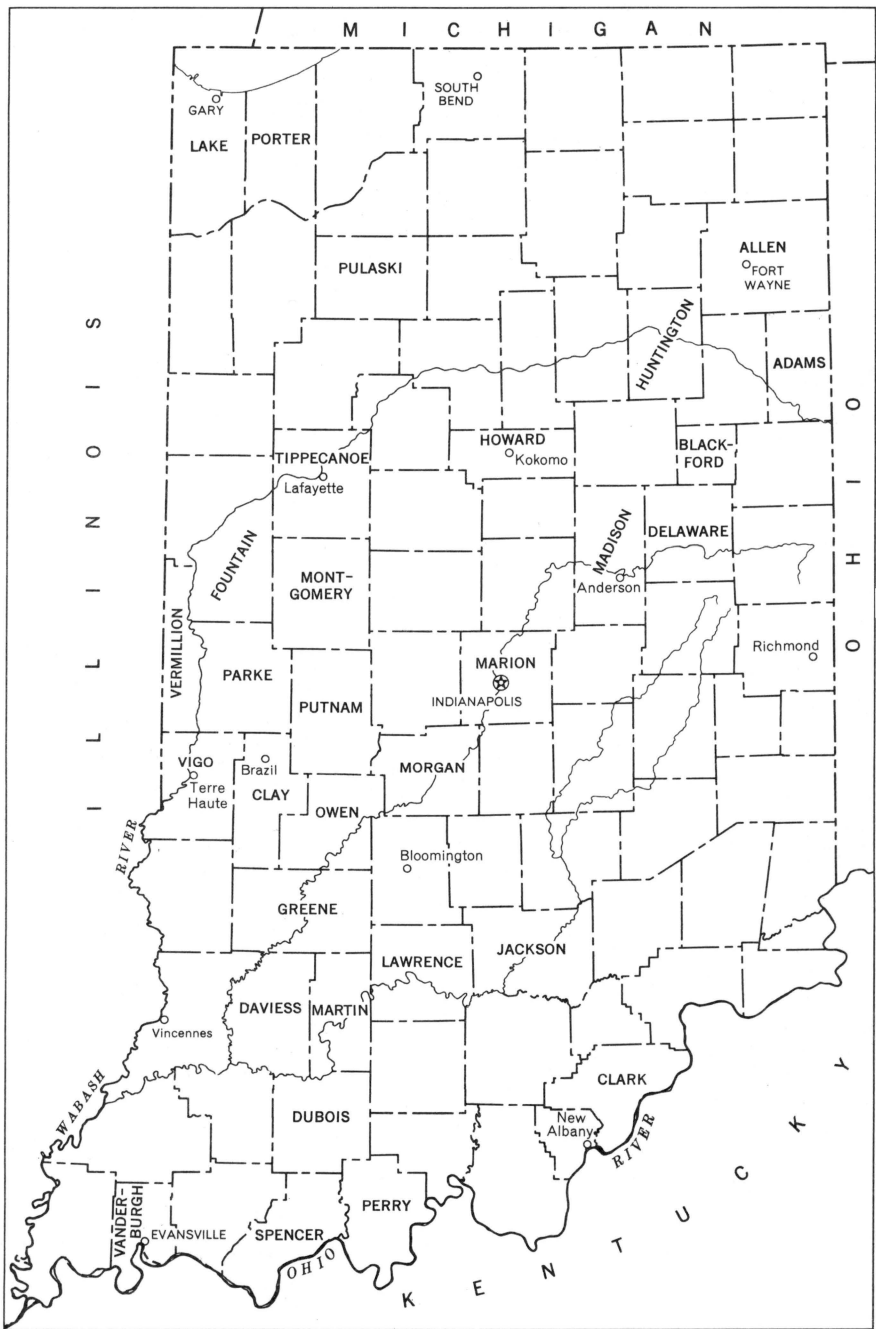
Figure 4. --Map of Indiana showing the location of counties mentioned in the text.