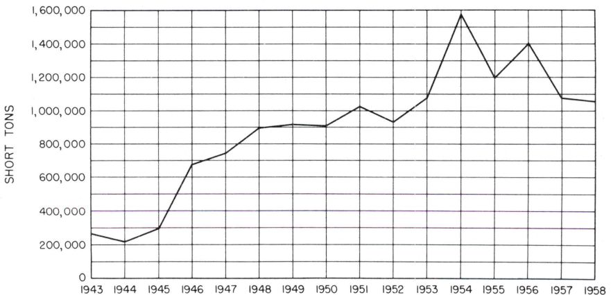
Figure 3.--Graph showing annual production of shale and glacial clay in Indiana, 1943-58. Data from U. S. Bureau of Mines Minerals Yearbooks, 1943-57, and Klyce and Patton, 1959.