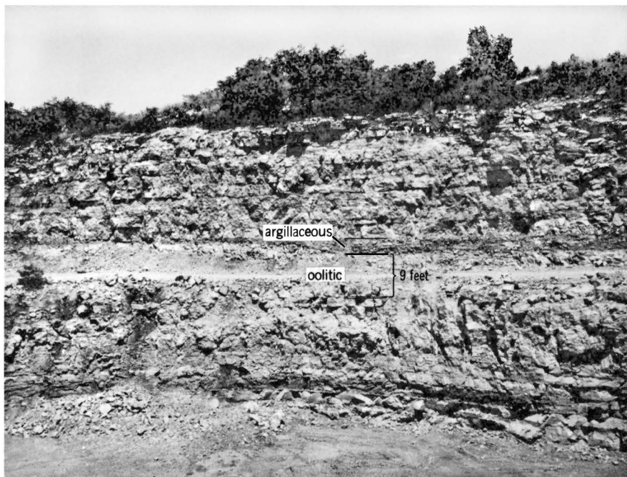
Figure 1. Northwest face, Radcliff, Inc., quarry, Orange County (SW \frac{1}{4} SE \frac{1}{4} sec. 24, T. 3 N., R. 1 W.), showing relationship between oolitic and argillaceous limestones of the Fredonia Member, Ste. Genevieve Limestone.

lower purity. In some places the units of high purity are thick enough to be quarried selectively; for example, 74 feet of high-calcium Paoli and Ste. Genevieve limestones in the Leavenworth section, Crawford County, is separated into three units 32, 29, and 13 feet thick (table 3) by a 1-foot unit and a 33-foot unit of low-purity stone. But many measured sections contain numerous thin beds of high-calcium limestone that could not be selectively quarried. Unlike Salem limestone, however, Paoli and Ste. Genevieve limestones make excellent aggregate and thus offer better possibilities for using stone that does not meet high chemical specifications.