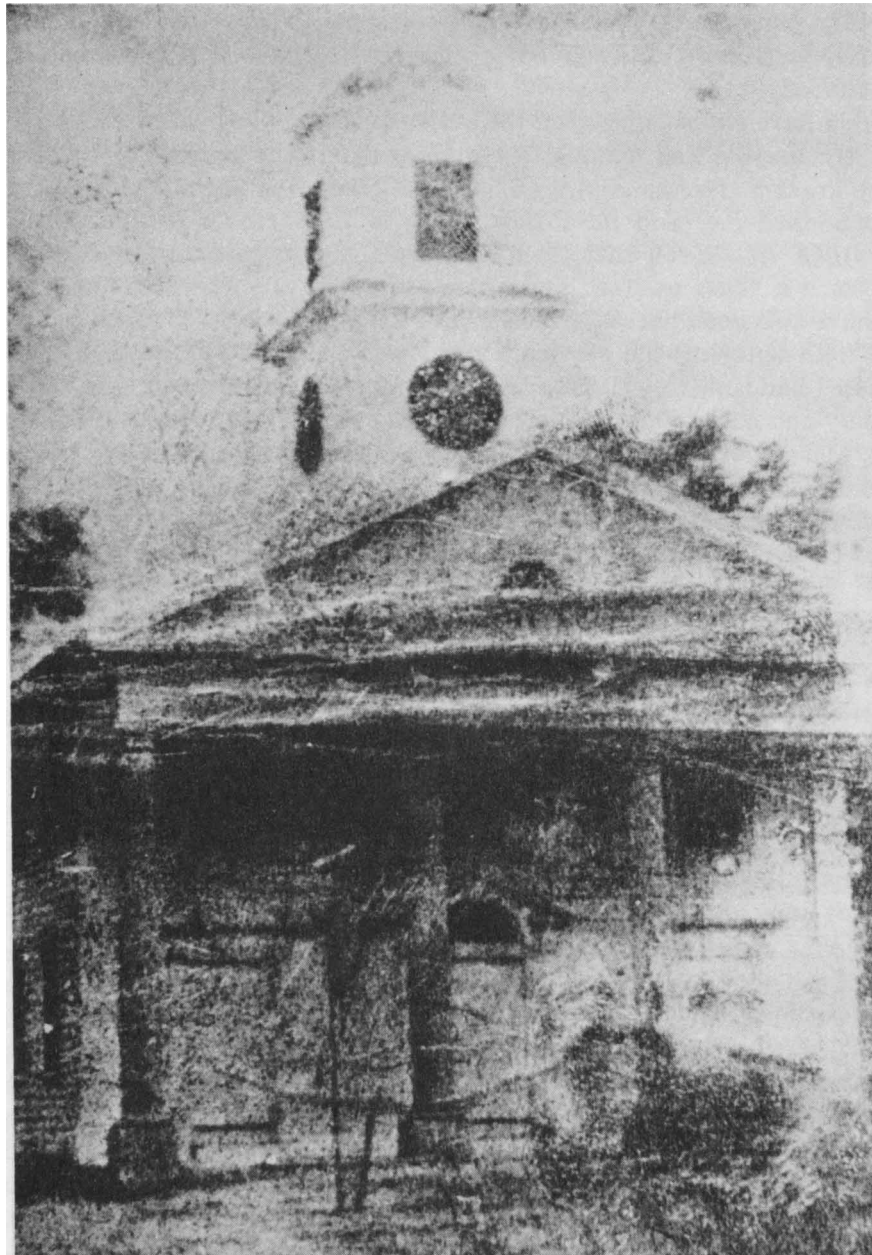
BLACK SWAMP BAPTIST CHURCH, ROBERTVILLE, SOUTH CAROLINA. (SEE FOOTNOTE 84)