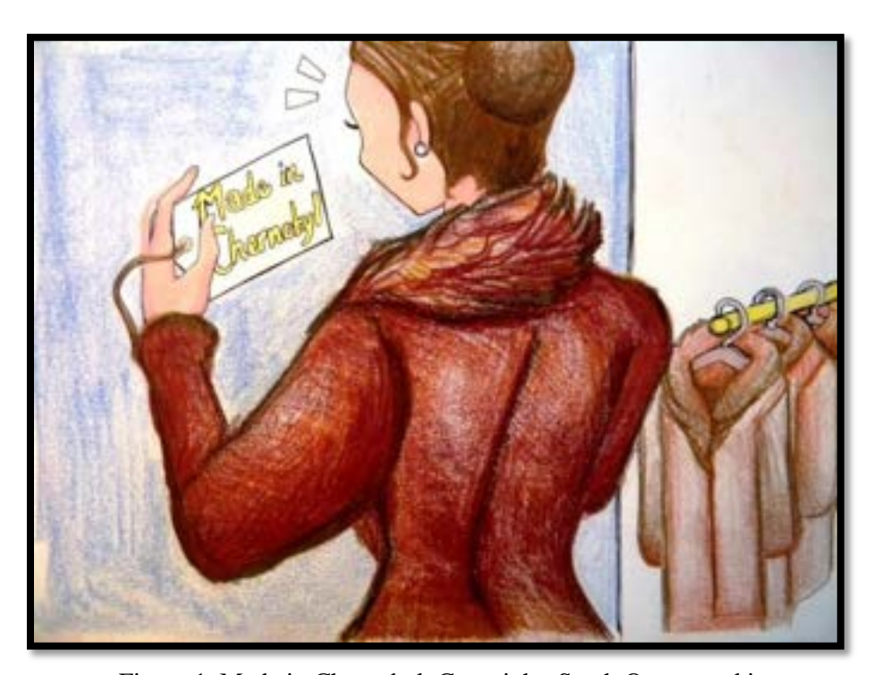
Figure 1. Made in Chernobyl.

But other types of farming have been proposed: forestry farms, fish farms and fur farms, as well as bee breeding and horse breeding. In fact, saplings for future forestry farms have already been planted in the zone. Bees would be kept not for honey, which most certainly would be radioactive, but to breed new colonies for sale. Similarly, fish farms would be for breeding young fish that would then be "finished" to adulthood in another location. Animals farmed for their fur would presumably be given non-local feed and water. This would be harder—though not impossible – to do with horses, if they were fed "imported" hay in winter and allowed to graze during summer only on grasses tested as "clean." These forms of farming, therefore, would focus on utilizing particular spaces in the zone for economic activity, while preventing the "products" from participating in the radioactive local food chain. Even if they are finished out elsewhere, will these fur coats, fish, bees, and trees sport a "made in Chernobyl" label?