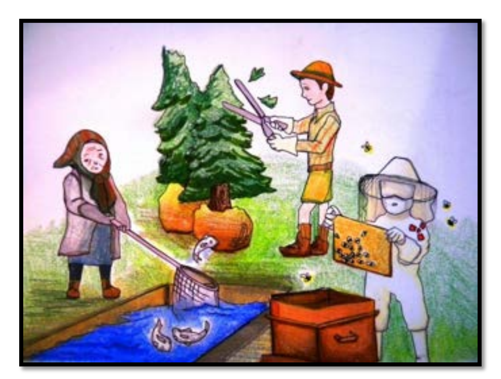
Figure 2. Farming in the zone.

And who will manage these farms? Former Nuclear Power Plant staff? Samoseli ? Unemployed university graduates from the U.S.?