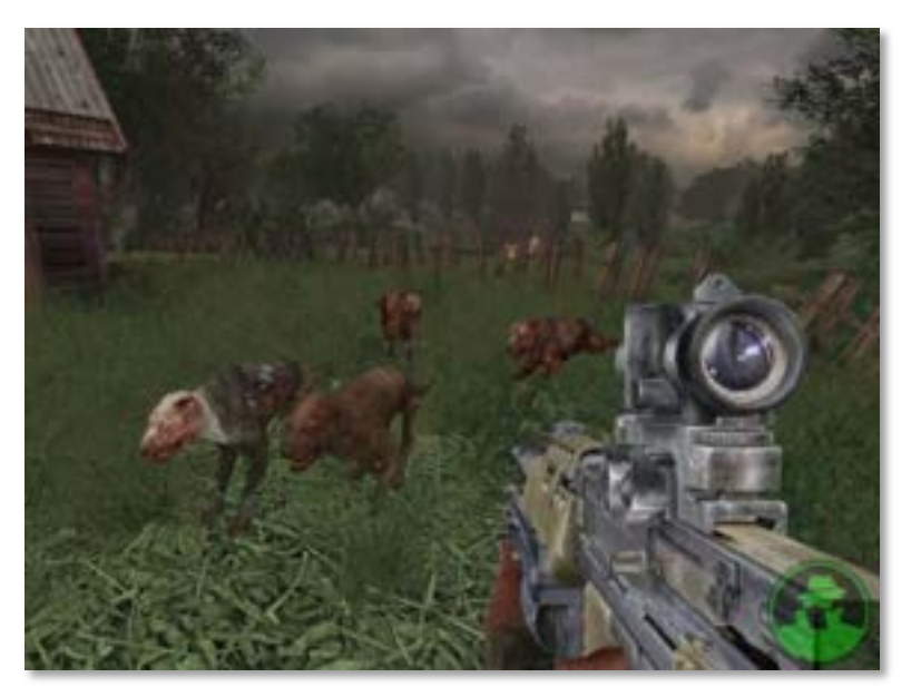
Figure 3. Still shot from S.T.A.L.K.E.R.

One suspects that after battling through a surreal virtual "zone of alienation" these gamertourists might experience the "real" Chernobyl zone as something of a letdown.