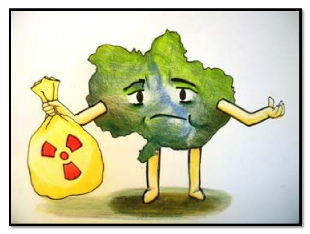
Figure 8. Ukrainian nuclear garbage worker.

It will be a long time before the EU allows Ukraine in the European Union, but perhaps in the meantime Ukraine can take out the garbage?