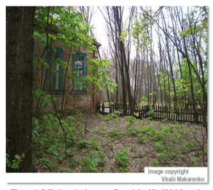
Figure 4. Still photo in the zone.