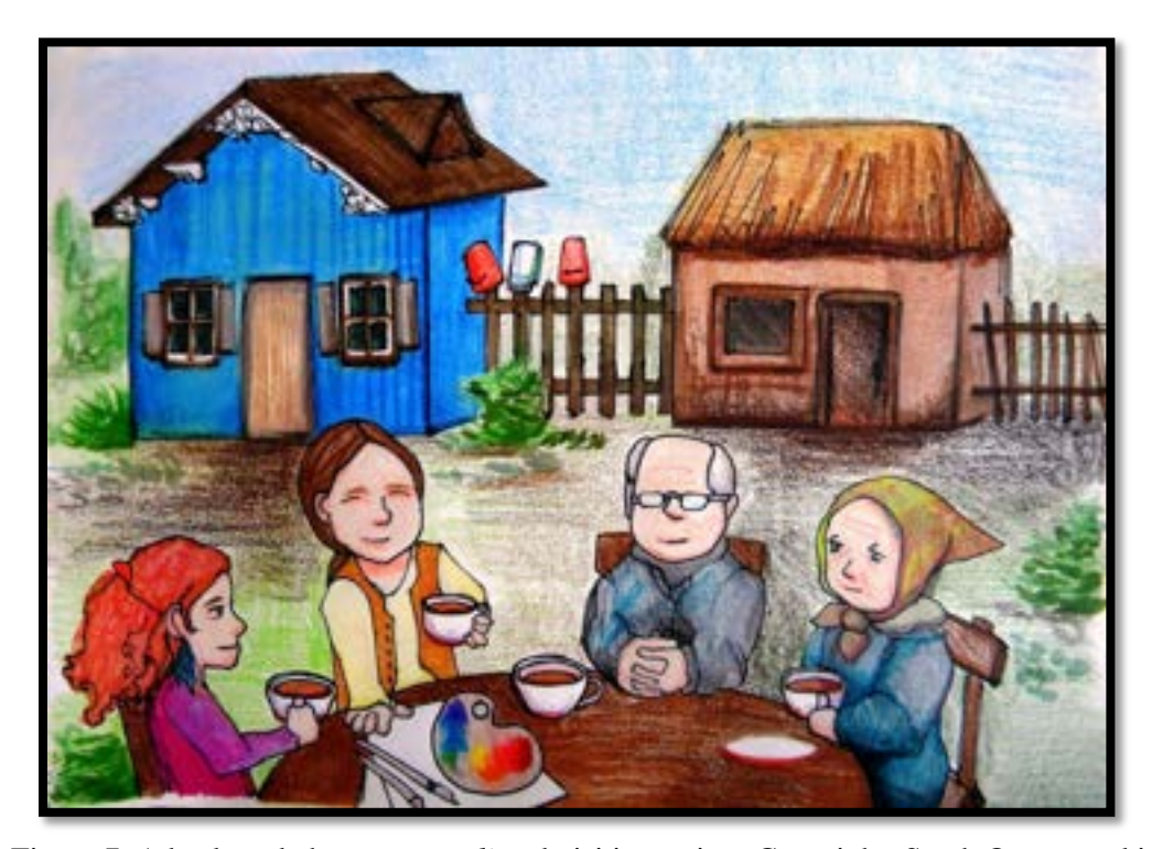
Figure 7. A backyard chat—samoseli and visiting artists.

The "Radiating Places" project and the 4<sup>th</sup> Blok collective are provocative for thinking about the continuing place for art and artists in the Chernobyl zone. What creative works might a space thought to be "dead" and damaged inspire? The Chernobyl art colony could be built in an area of the zone with low levels of radiation, and residents could take their meals in a cafeteria with food "imported" into the zone. Or, artists could be housed right alongside some of the samoseli , in fixed-up evacuated houses in a classic Ukrainian-Polissia village setting. Limiting visits to a few weeks or a month, as is standard in many art colonies, would be especially appropriate in this case.