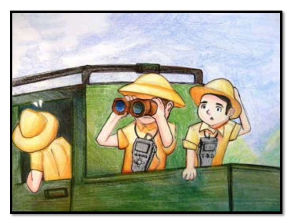
Figure 5. Chernobyl safari.

Think of such tours as a weekend Chernobyl safari, with dosimeters.