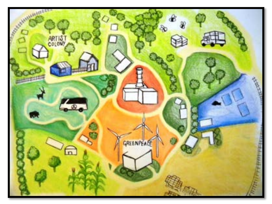
Figure 10. Chernobyl Visitors' Center. FREE MAP!