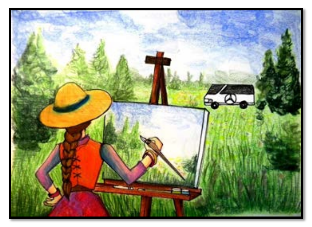
Figure 6. The artist at work, Chernobyl.

artists interested in ecological issues, unusual landscapes, and diverse flora and fauna. At the very least, artists would have a quiet place to work (if they can avoid the tourists).